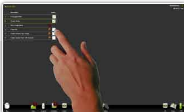
Start of the day