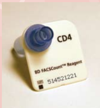
BD FACSCount CD4 Reagent (Cat. No. 339010)

This reagent delivers absolute CD4 counts and CD4 percentages.