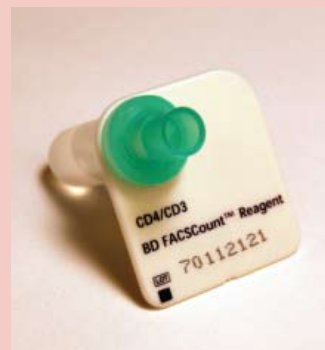
BD FACSCount CD4/CD3 Reagent Kit (Cat. No. 342512)

This reagent delivers absolute CD4 counts and CD4 percentages.