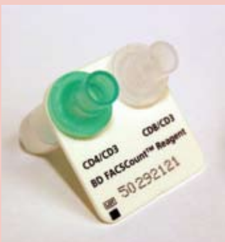
BD FACSCount Reagent Kit (Cat. No. 340167)

Thousands of healthcare workers in more than 50 developing countries have participated in the BD workshops, resulting in a significant improvement of clinical and laboratory services.