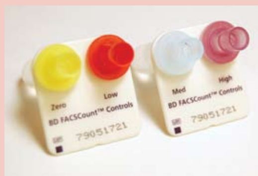
BD FACSCount Control Kit (Cat. No. 340166)