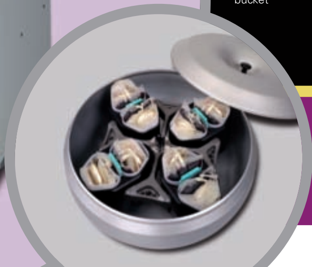
LH-4000W rotor with double blood bag buckets